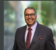
Naheed Nenshi Leader of Alberta's New Democrats

During his three terms as mayor between 2010-2021, Calgary was named the third best city to live in globally. His leadership in Calgary saw an unprecedented investment in quality of life including transit, roads, recreation centers and libraries. He also saw the City of Calgary through four states of emergency, including devastating floods in 2013 and the COVID-19 pandemic and was named the best mayor in the world in 2014.